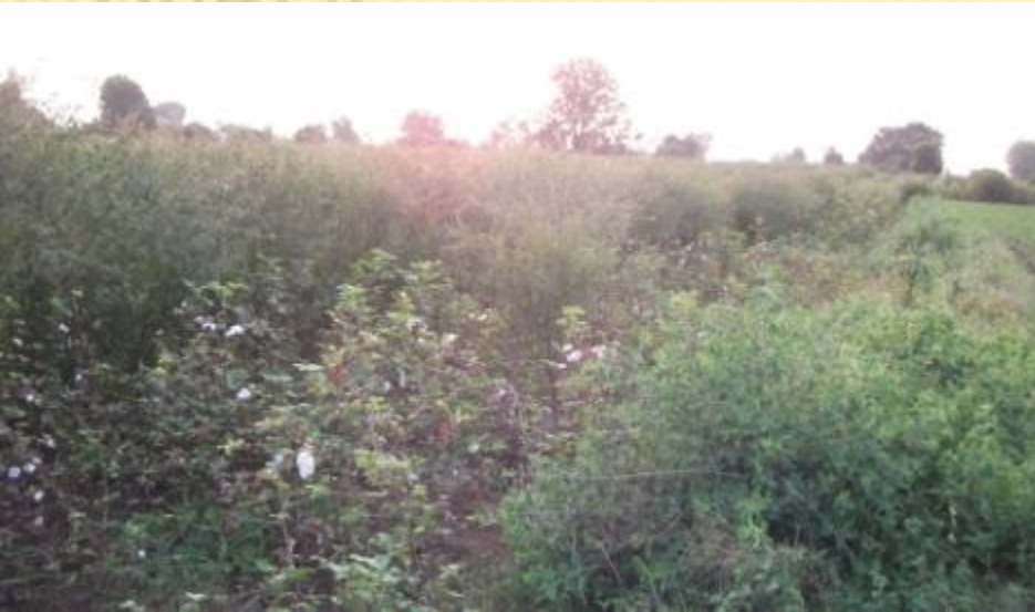
Fields with alternating lanes of Dahl (or Dal) and Cotton