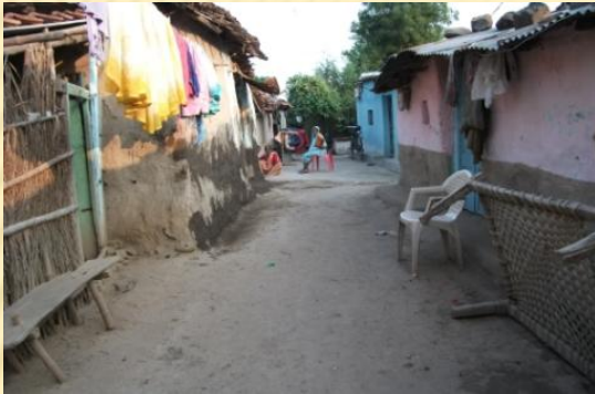
The road where the house is.