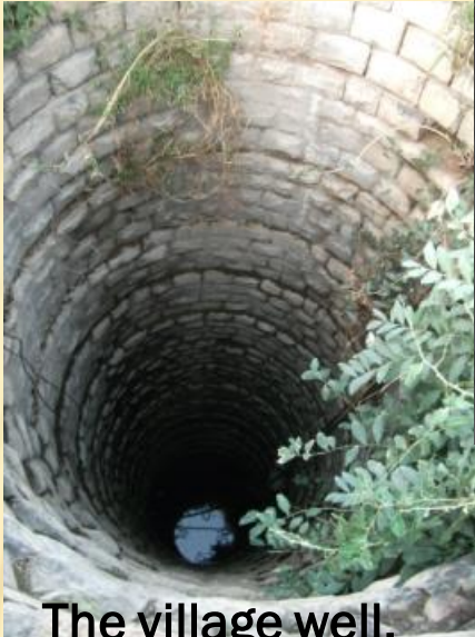
The village well, only source of drinking water