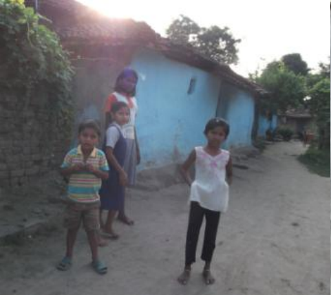
Children and elderly people