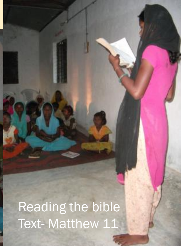
Reading the bible Text- Matthew 11