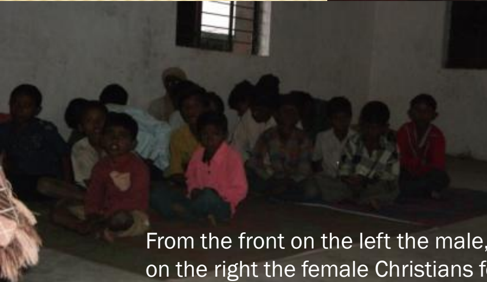
From the front on the left the male,