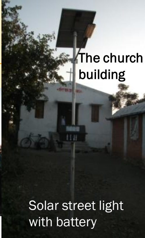
The church building