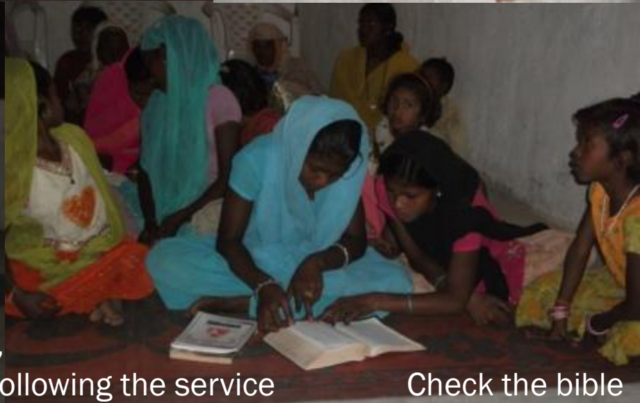
on the right the female Christians following the service