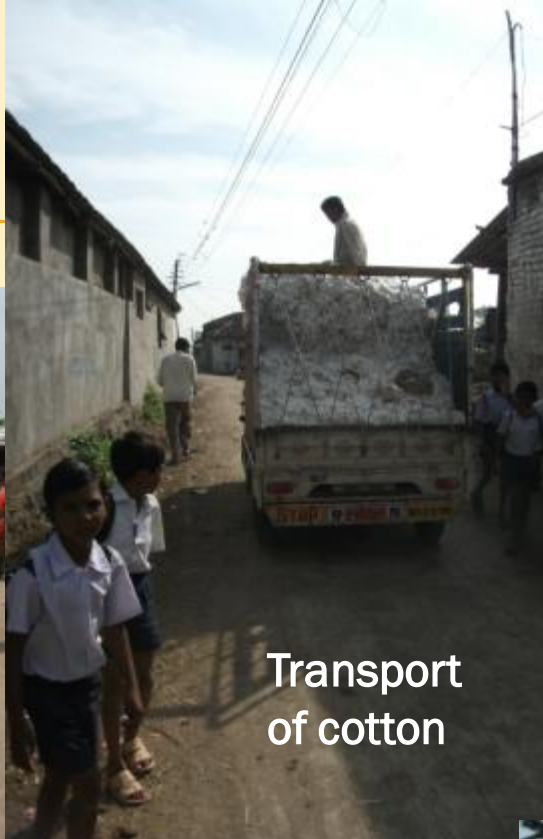
Transport of cotton