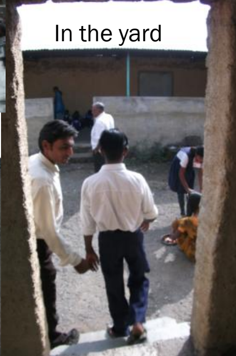
In the yard