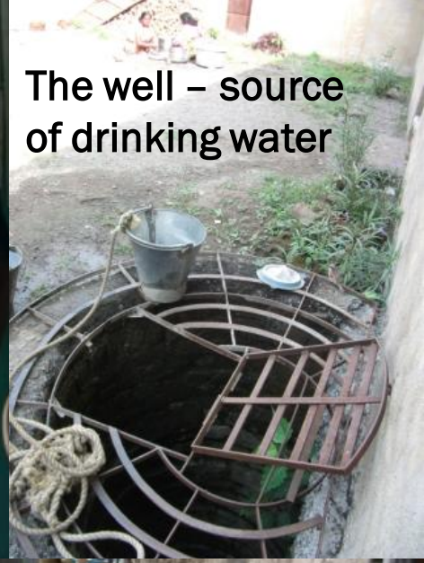
The well – source of drinking water