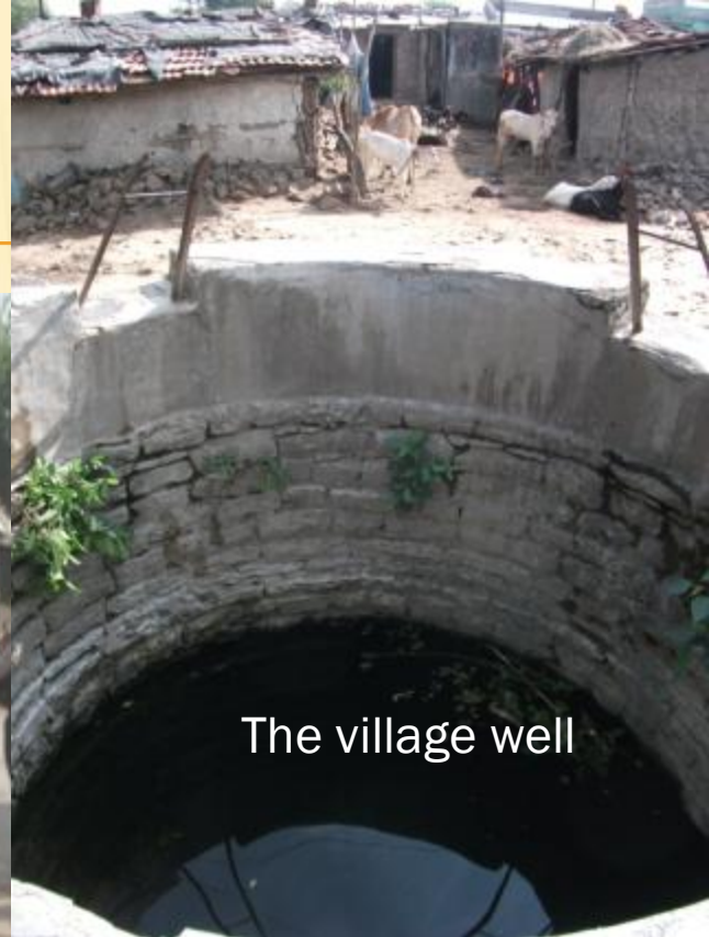
The village well