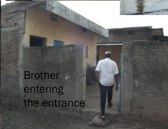
Brother entering the entrance