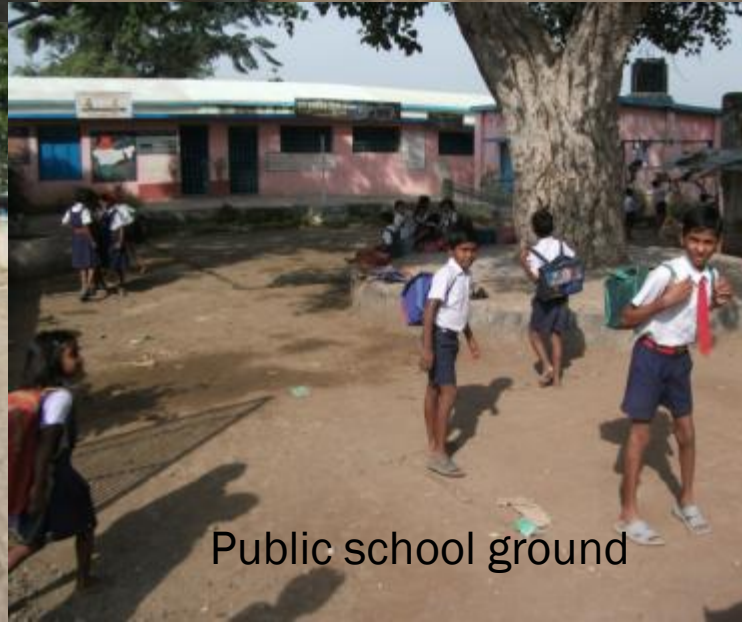
Public school ground