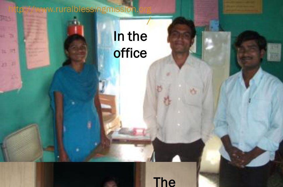
In the office