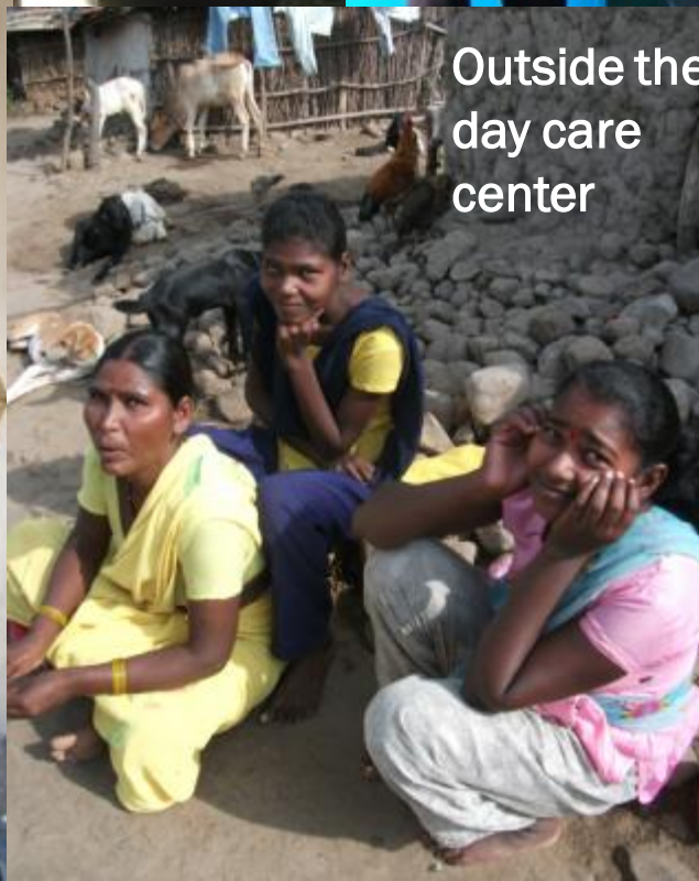
Outside the day care center