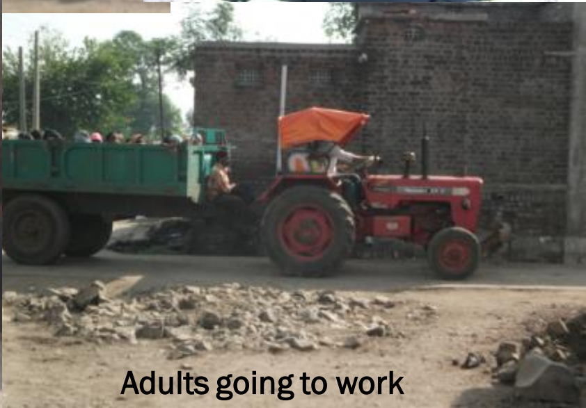
Adults going to work