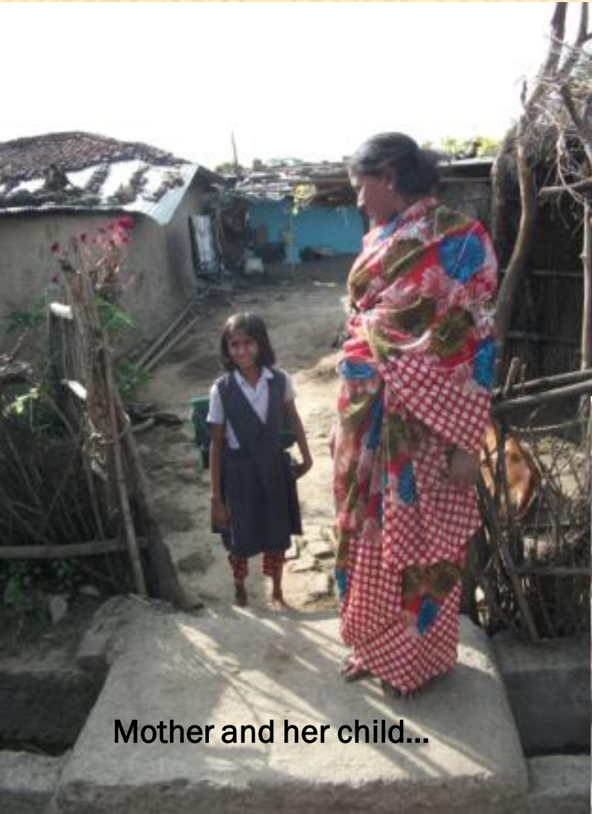
Mother and her child...