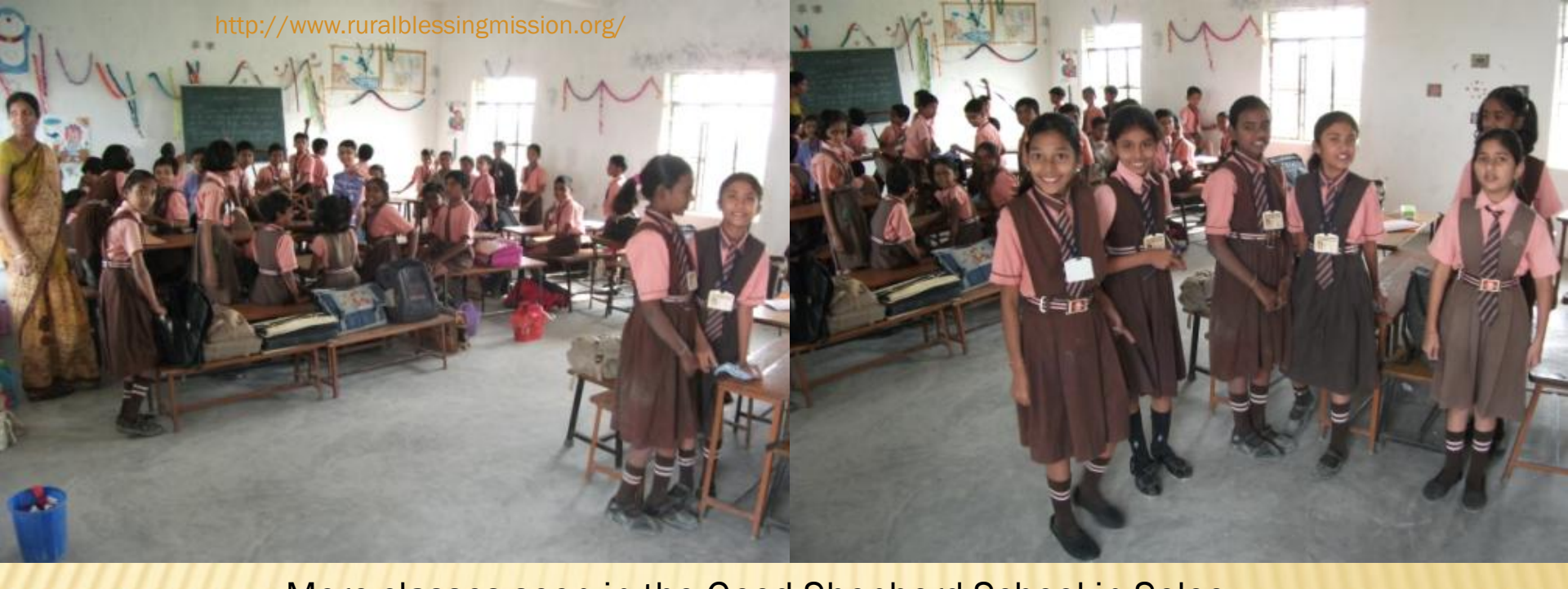
More classes seen in the Good Shepherd School in Seloo